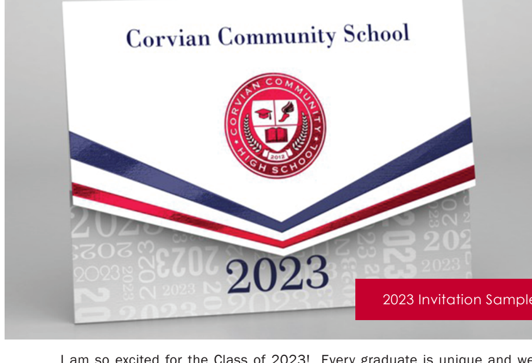
2023 Invitation Sample

Class of 2023 Sweatshirts and Tees Ordering information will be posted in January on Schoology.