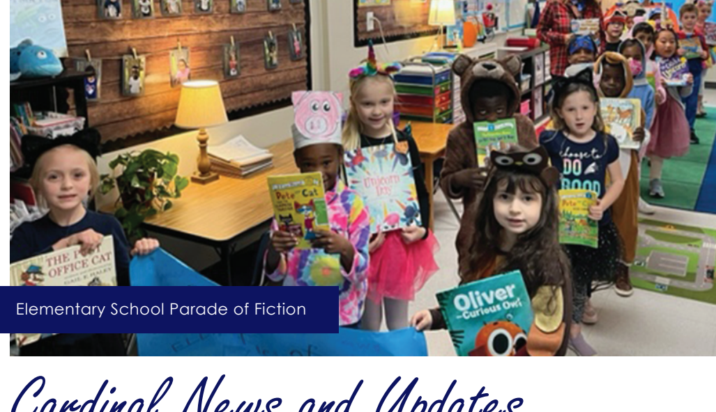
Elementary School Parade of Fiction

During this busy and festive time of year I find myself reflecting on life's blessings and how proud I am of our school! I am so thankful to be a part of such a great school community! I hope each of you have a wonderful holiday season and great start to 2023!