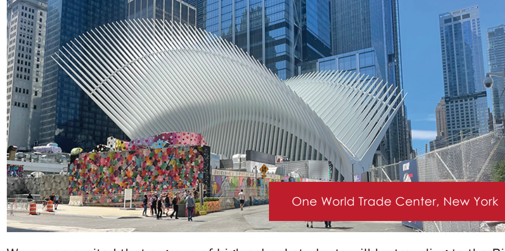
One World Trade Center, New York

We are so excited that a group of high school students will be traveling to the Big Apple during Spring Break! Students will spend four days exploring New York City which includes a walking tour of Midtown to see the United Nations Headquarters, Grand Central Station, Rockefeller Center, and St. Patrick's Cathedral. On the trip, they will also visit Ellis Island and the Statue of Liberty, the 9/11 Memorial, the Metropolitan Museum of Art, Times Square, and Central Park. Of course, no trip to NYC would be complete without attending a Broadway play and touring Chinatown, Little Italy, Greenwich Village, and SoHo. This is such an exciting opportunity for